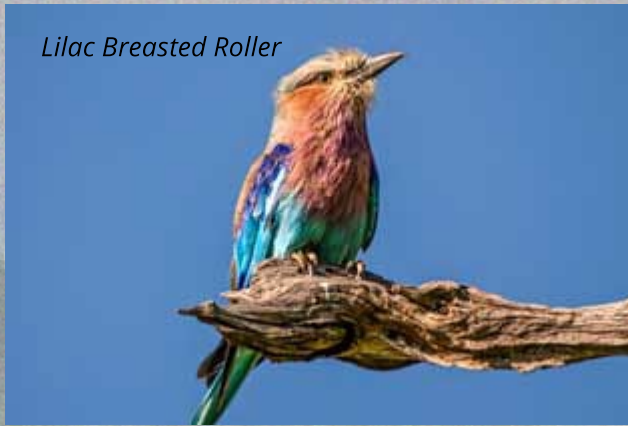
Lilac Breasted Roller