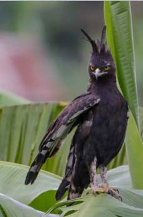
Long Crested Eagle