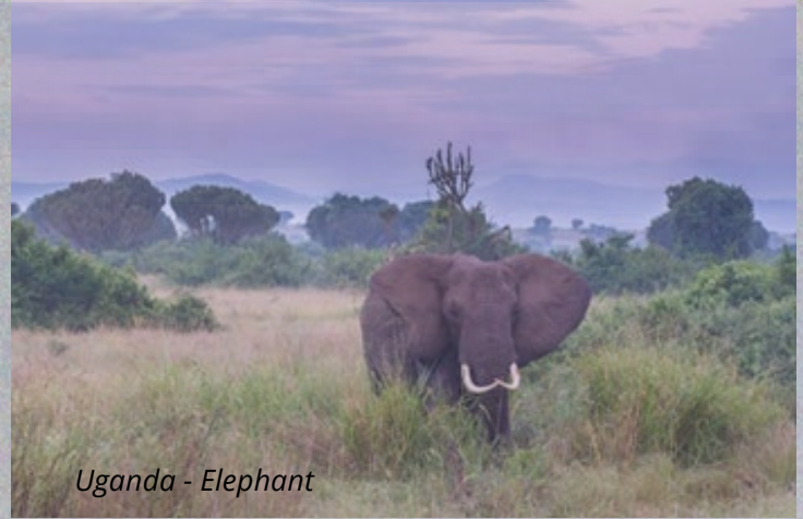
Uganda - Elephant